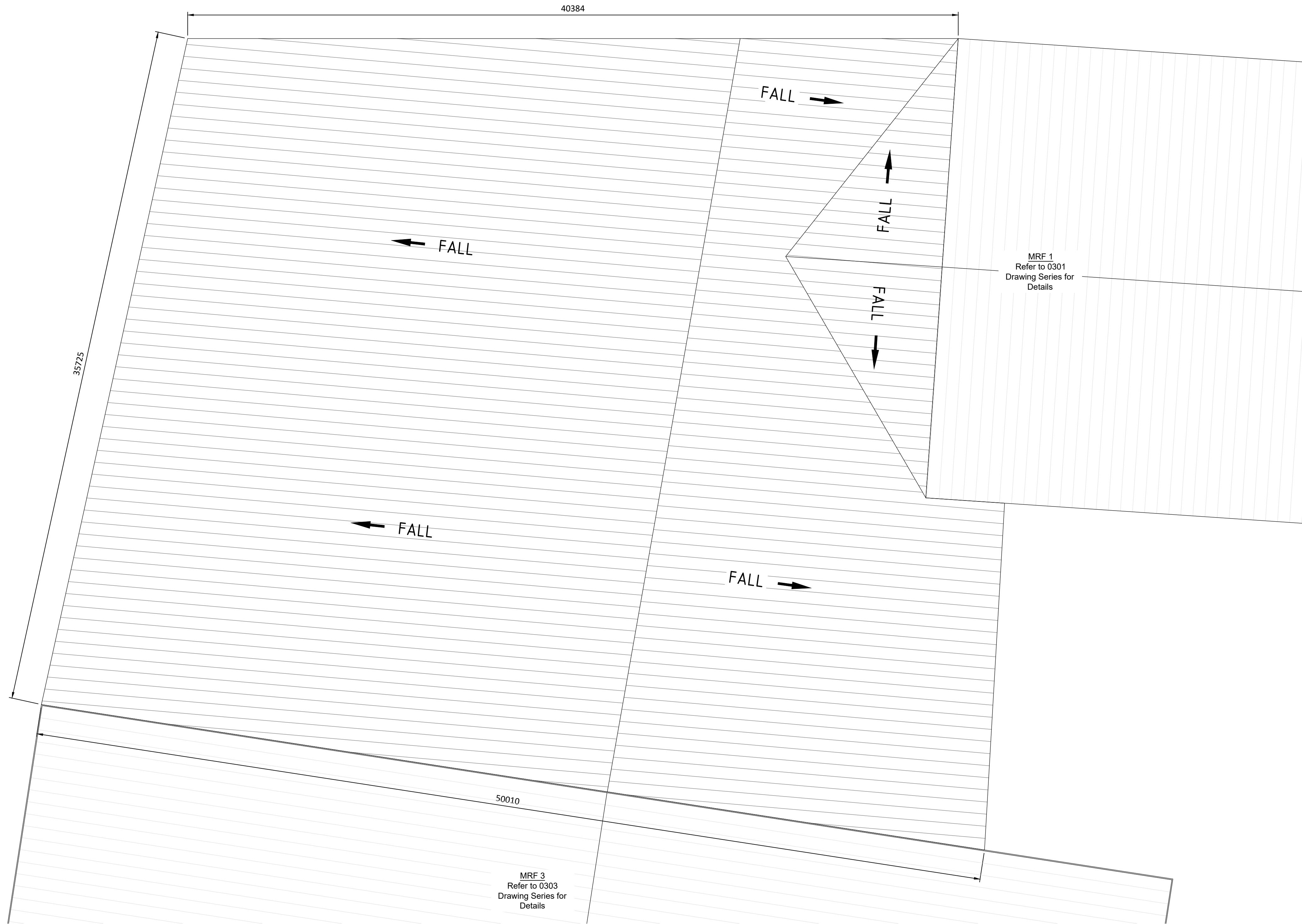
ROOF PLAN Scale 1:125